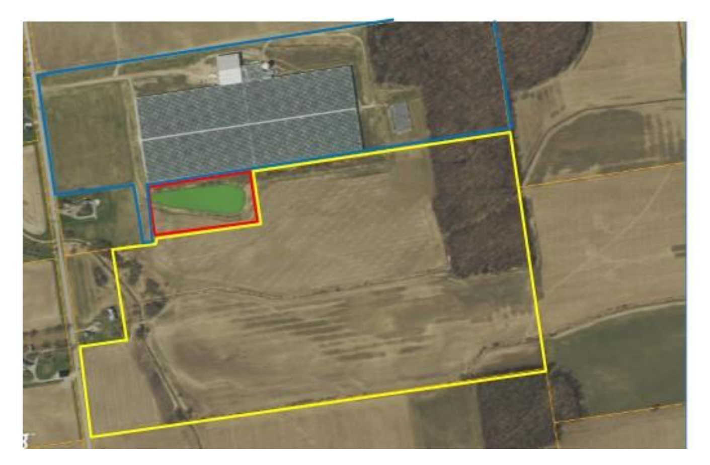
Figure 1: Aerial of Subject Property. Severed parcel identified in red. Retained parcel identified in yellow. Lands severed parcel is to be added to shown in blue.