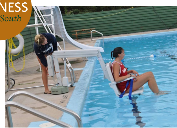
Pool staff demonstrates the operation of the newly installed lift.

Recreational programs offered at the facility include group and private swimming lessons, swim teams, public swims, Tim Horton's Family Free Swims, and aqua fit swims. In addition, the pool is rented for supervised private rentals.