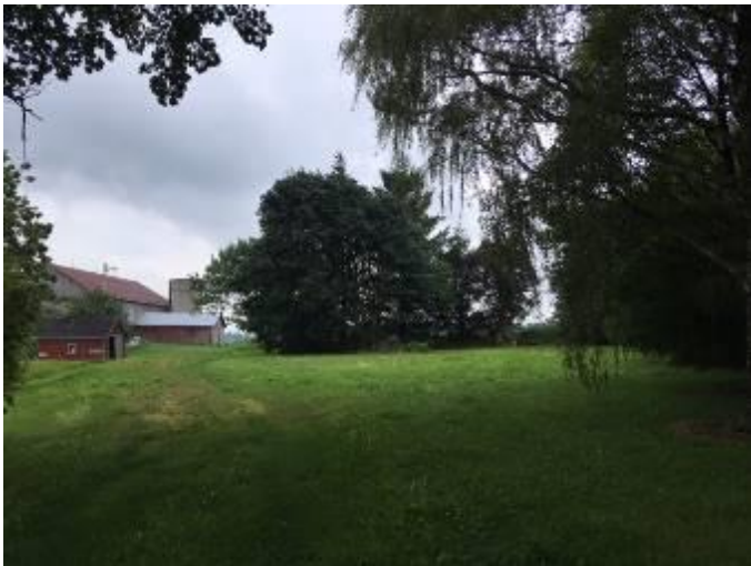
Figure 3 and 4: Demolished Dwelling location.

The subject lands are designated Agriculture in the Huron County Official Plan and Agriculture and Watercourse in the South Huron Official Plan. This request will be reviewed under policies for land division in Prime Agricultural areas through review of applicable policies in the Provincial Policy Statement, Huron County Official Plan and South Huron Official Plan.