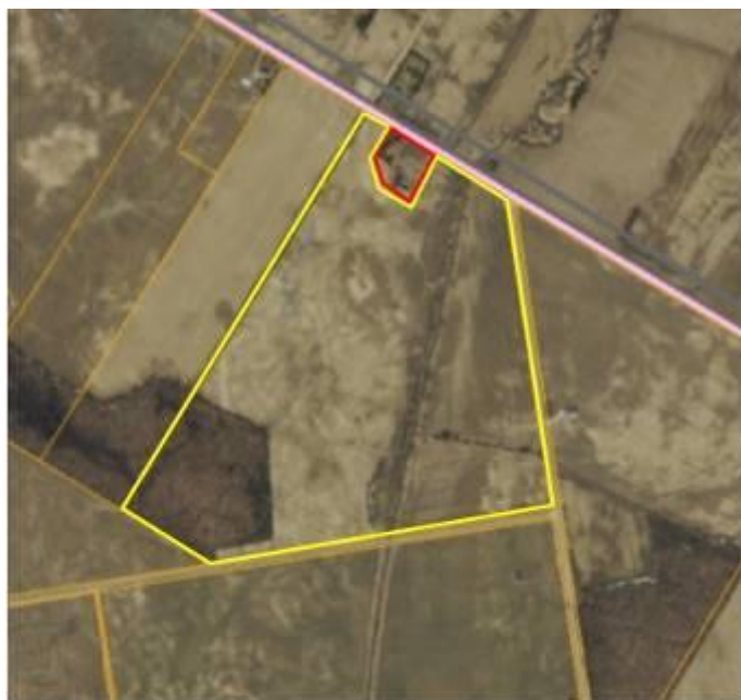
Figure 2: Aerial of land to be severed