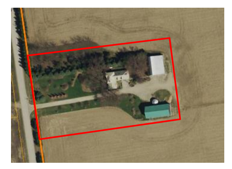
Figures 3, 4 and 5: Photos of structures on land to be severed.