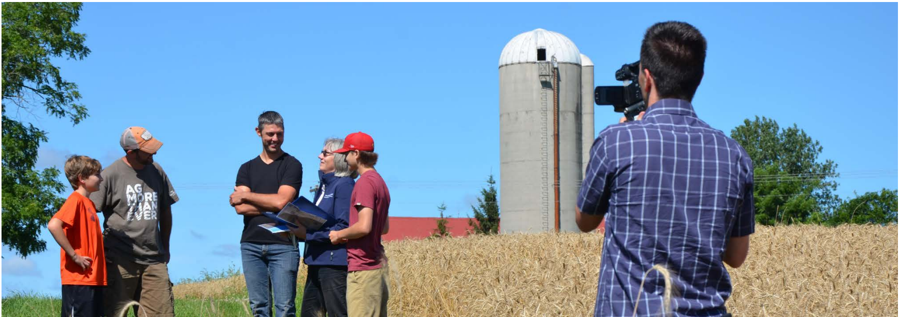
Summer 2017 CTV News: Fields to Fork Feature on HCWP and Cover Crops