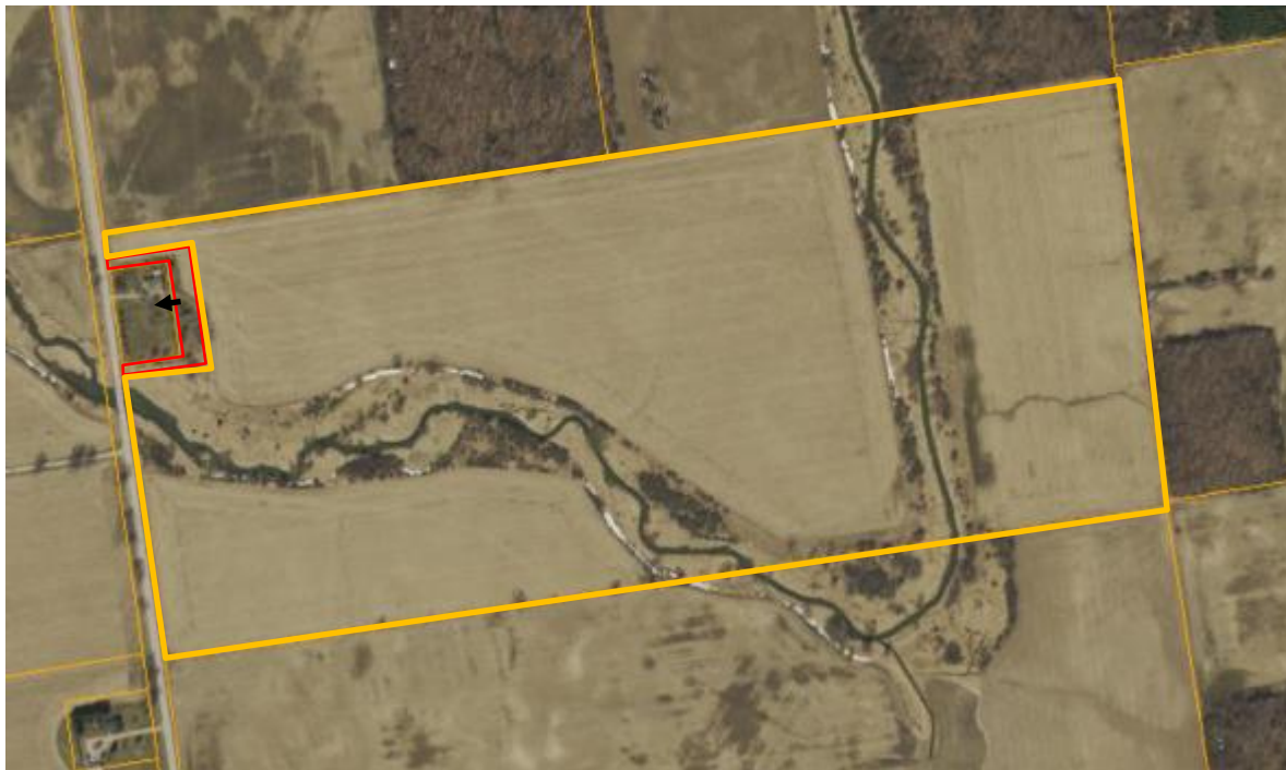
Figure 1: Aerial of subject property. Retained parcel identified in yellow. Severed parcel identified in red. To be added to lands to west, being an existing Agricultural Small Holding.