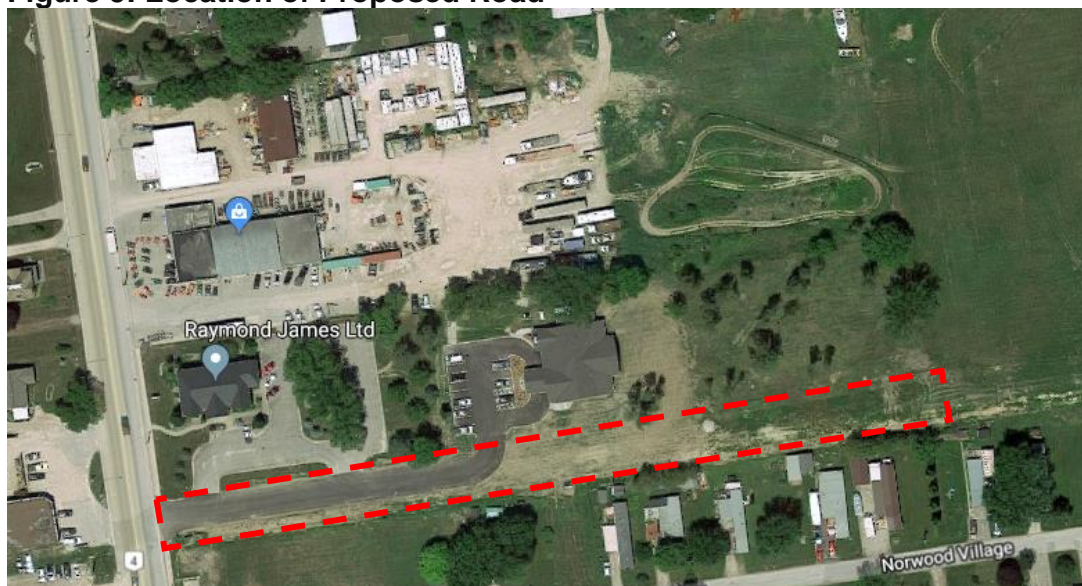
Figure 5: Location of Proposed Road

Primary access into the subdivision will be off London Road with a secondary access off of Simcoe Street. The London Road access involves the approval of a new road. The new road will be located on the lane which currently serves Jessica's House (see Figure 5). The road connection to Highway 4 (London Road) is an element of infrastructure required to serve the development but is outside the boundaries of the Plan of Subdivision; the Integrated Environmental Assessment approach is being utilized to address the approval requirements of the new road. The Simcoe Street access will be located on lands immediately south of Albert Street. Lots 68, 69 and 70 front onto Simcoe Street and will form part of the Simcoe Street streetscape. The balance of the subdivision will be serviced by new roads internal to the subdivision; these roads will become public streets to the satisfaction of the Municipality.