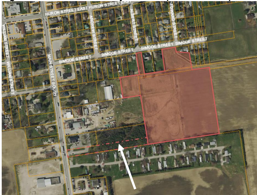
Proposed Location of Hwy 4 Access