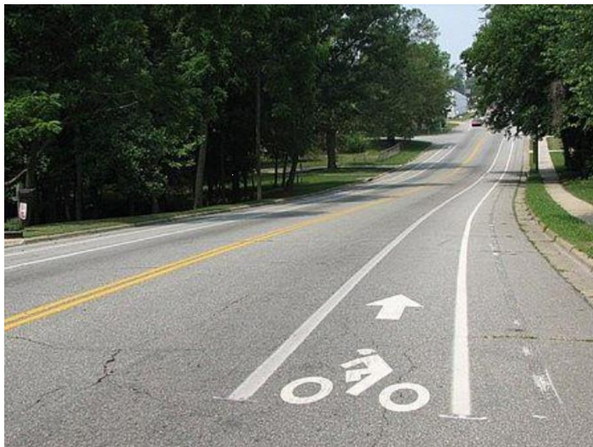
Figure 3 Cycling Lane in Europe