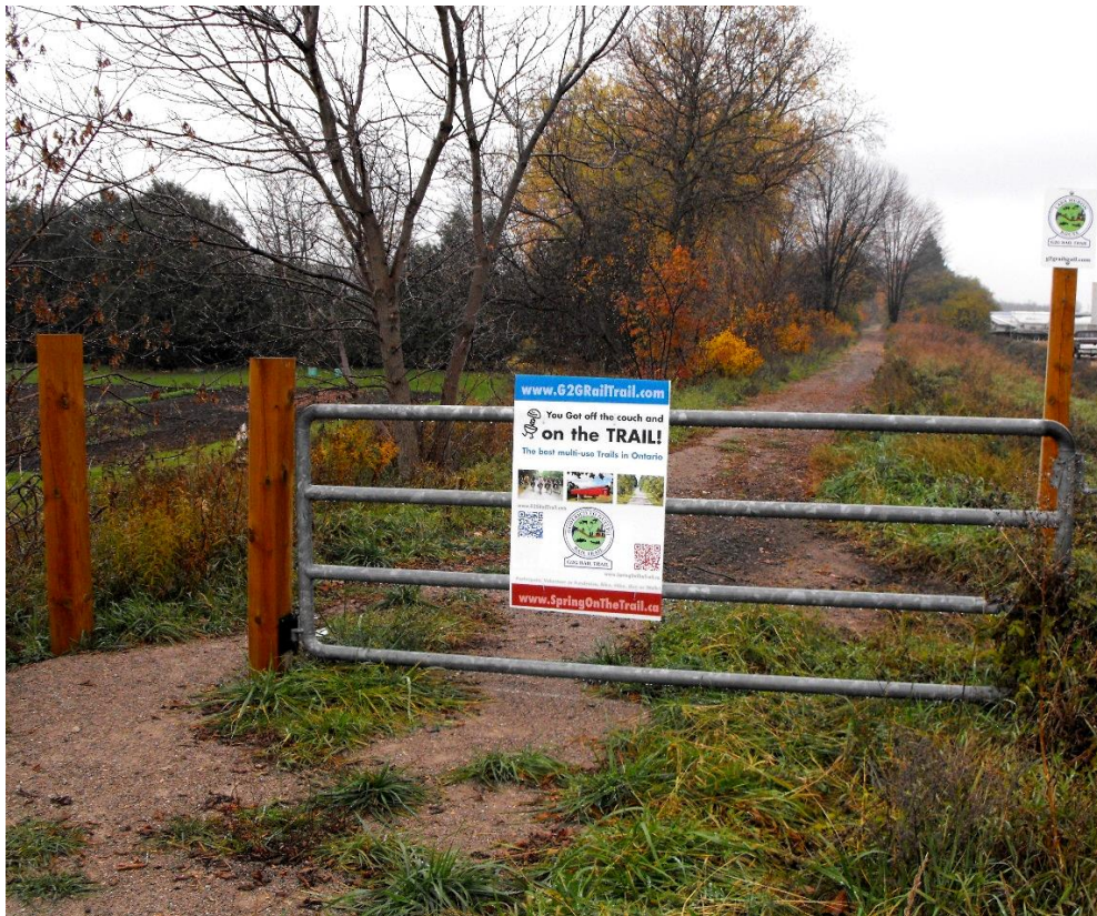
Figure 5 G2G Trail Crossing in Walton