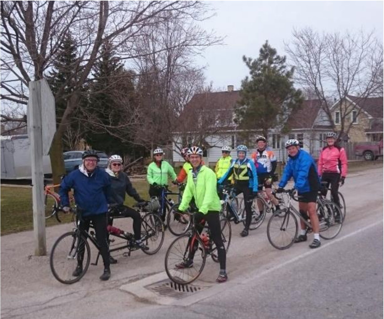
Figure 2 Group of Huron County Cyclists

The budget for implementing some of the action items in the Cycling Strategy will be drawn from existing departmental resources (e.g. create a Huron County Cycling Advisory Committee), or by other organizations, funders and agencies (e.g. OPP, G2G). Other actions and special projects will be brought to Council for consideration in the 2017 budget process (i.e. paved shoulders, signage).