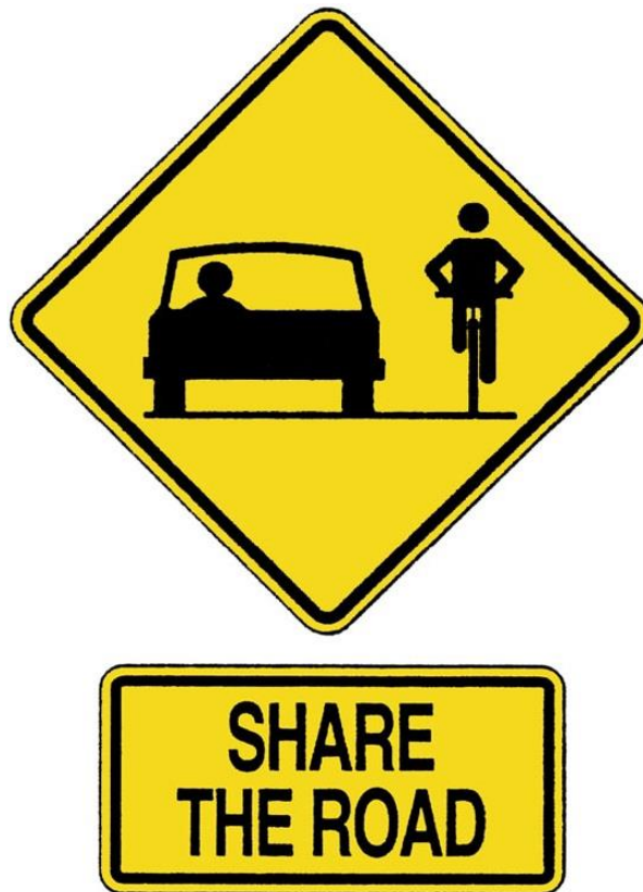
Figure 4 Share the Road Signage from Book 18