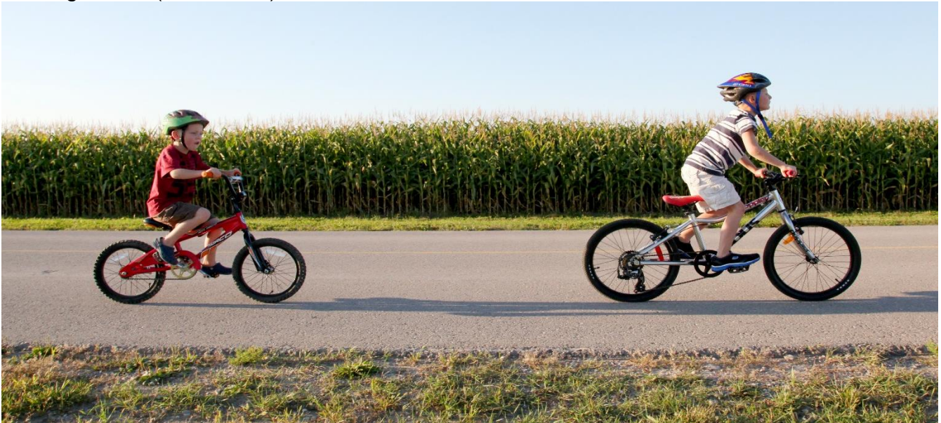
Figure 7 Young children riding their bikes