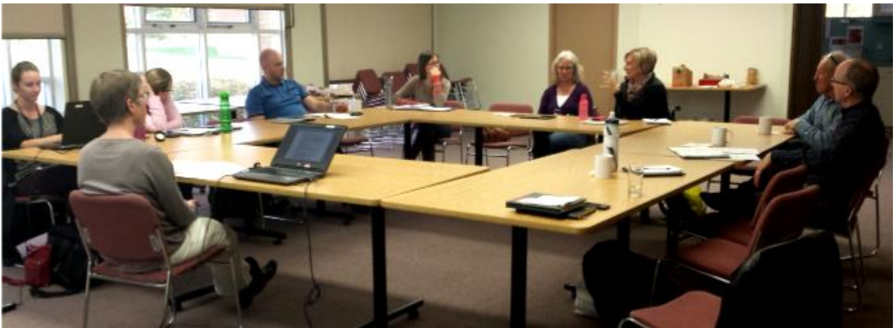
Figure 1 Cycling strategy committee meeting to discuss the strategy in Clinton

A summary of the comments from the public are included in Appendix B (35 responses were received).