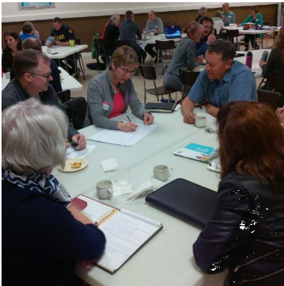
Figure 6 Workshop participants discussing around the table at the Share the Road workshop in Holmesville.