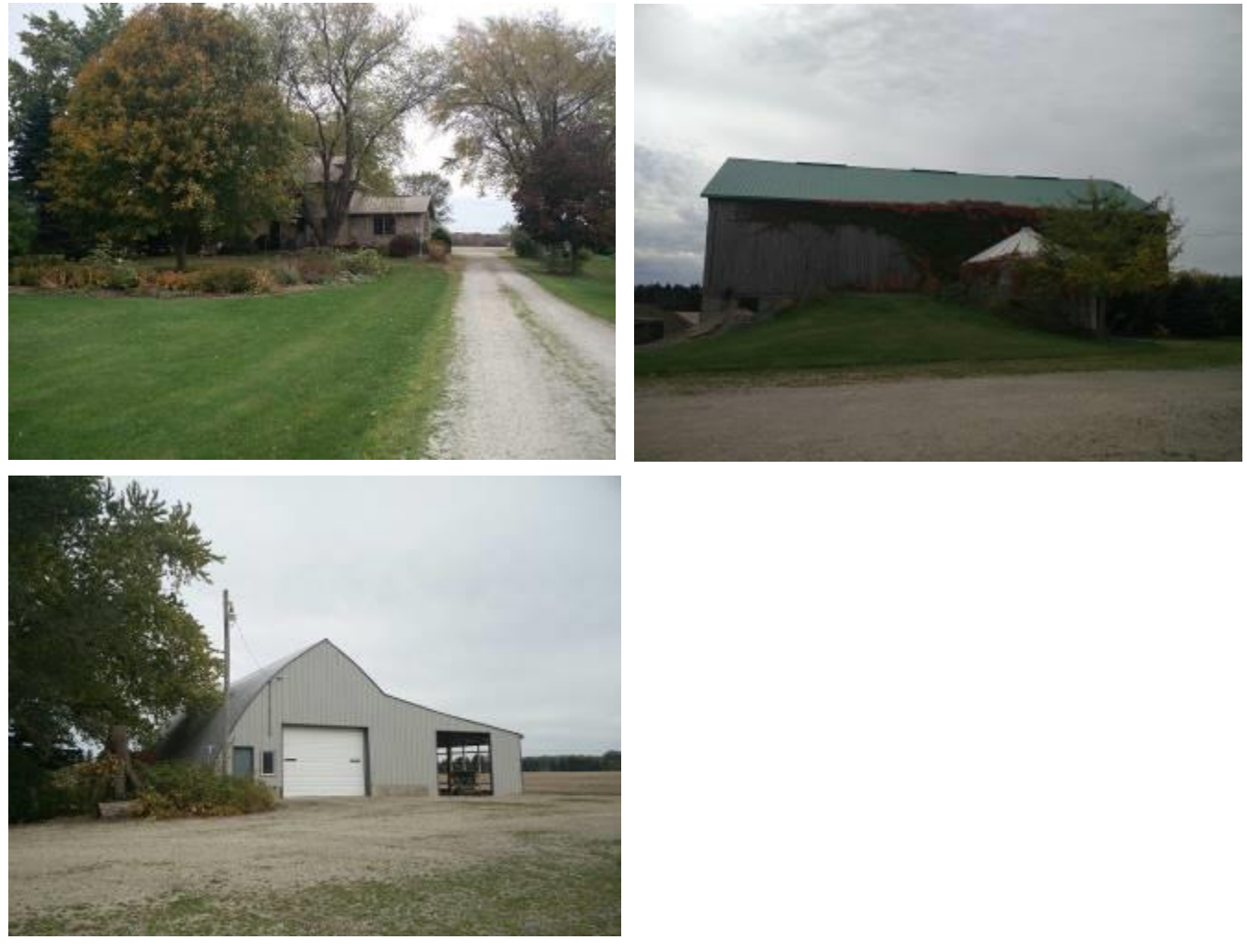
Official Plan Policies

The purpose of this application is to sever a dwelling made surplus as a result of farm consolidation.