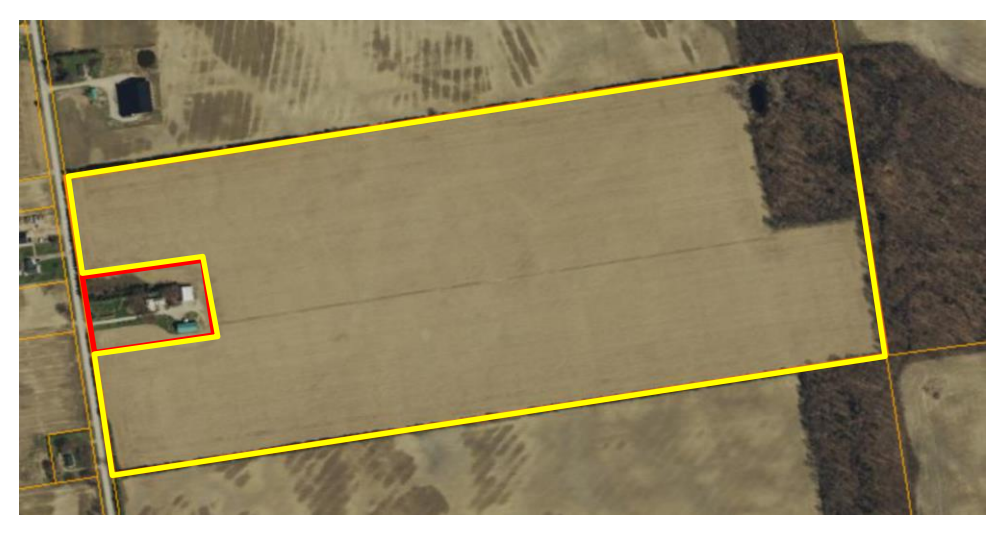
Figure 2: Aerial of Severed Parcel.

Figure 1: Aerial of Subject Property. Retained Parcel identified in Yellow. Severed Parcel identified in Red.