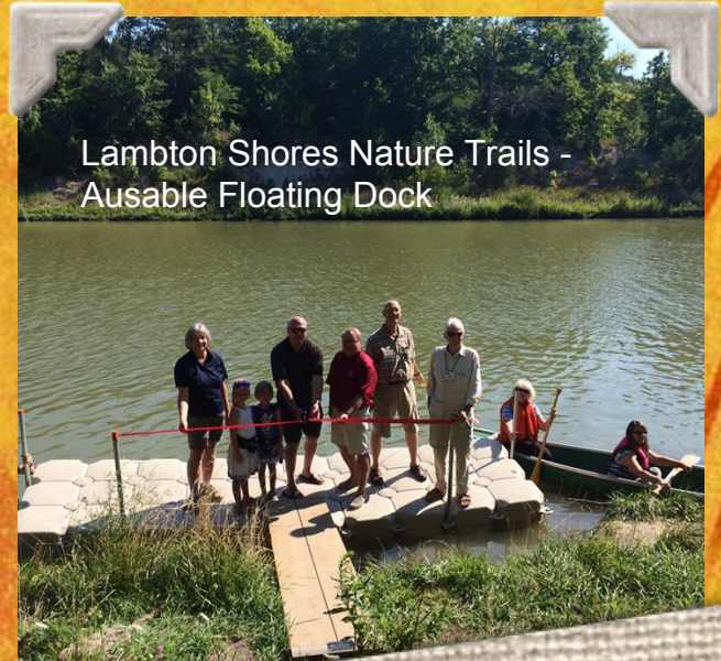
Lambton Shores Nature Trails - Ausable Floating Dock