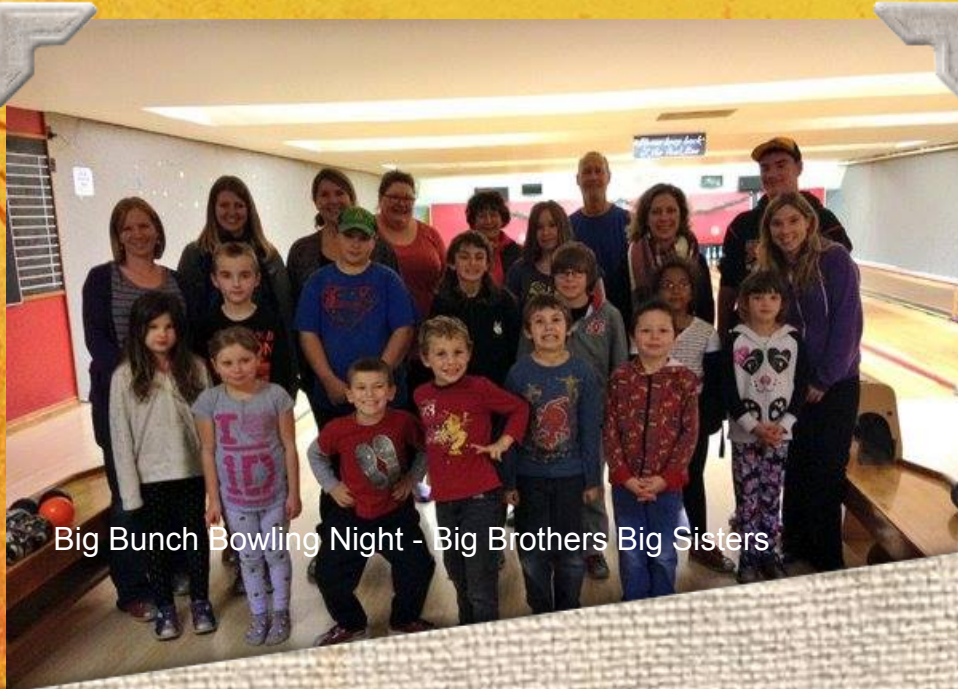
Big Bunch Bowling Night - Big Brothers Big Sisters