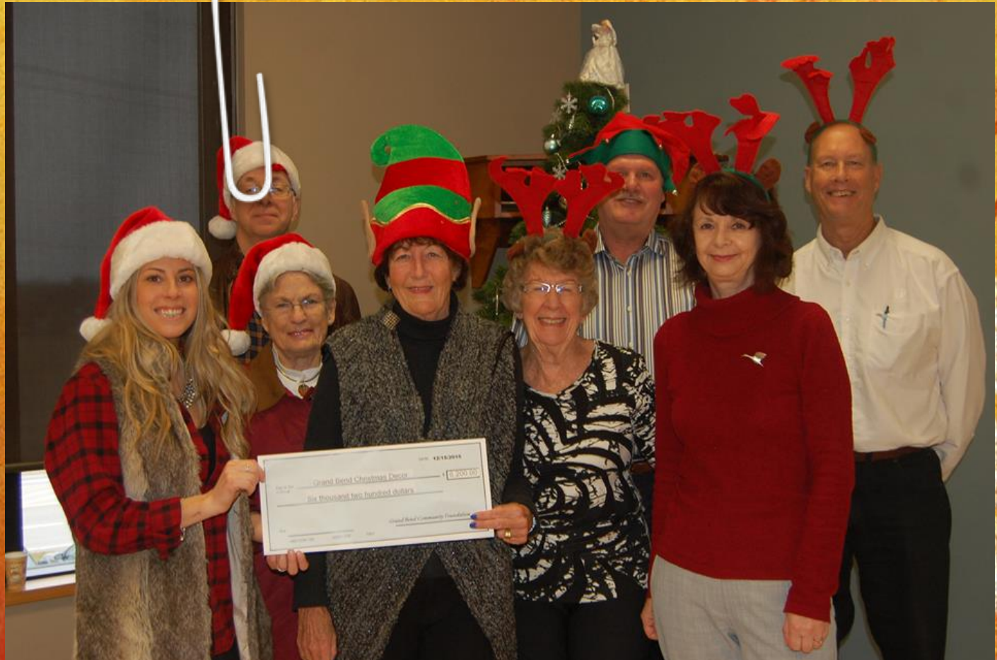
Photo: Grant Grand Bend Christmas Decor project.

Board Members, Volunteers, Community Members and Donors