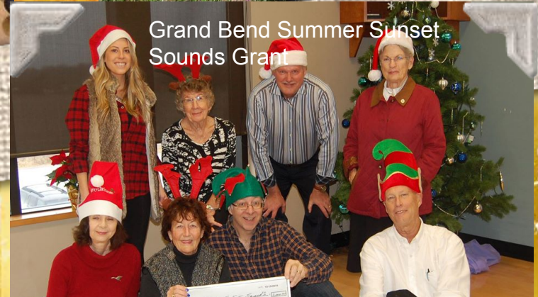
Grand Bend Summer Sunset Sounds Grant