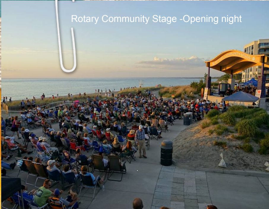
Rotary Community Stage -Opening night