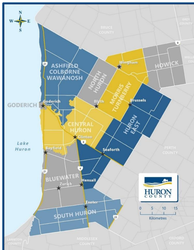
Huron County Map

The Huron County Accessibility Advisory Committee (HCAAC) serves as the Accessibility Advisory Committee (AAC) for Huron County,