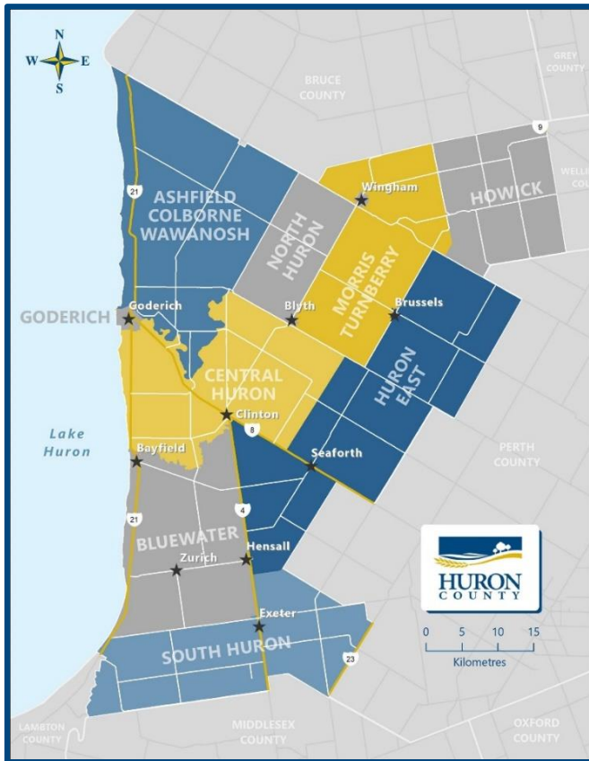
Huron County Map

The Huron County Accessibility Advisory Committee (HCAAC) serves as the Accessibility Advisory Committee (AAC) for Huron County,